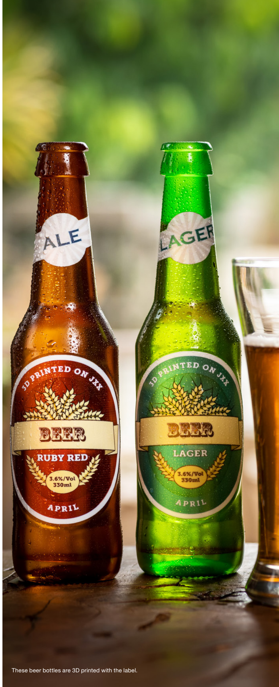
These beer bottles are 3D printed with the label.

Go beyond traditional concept writeups and sending rendering illustration pictures over email. Produce highly-realistic, tangible prototypes and gain accurate feedback and early buy-in from customers and stakeholders before committing to costly packaging production. Combine exceptional transparency with saturated, opaque graphics all in one print. Produce sharp graphics that meet 2D graphics labeling standards. Simulate clear, spray-painted or tinted glass as well as transparent or colored plastic with smooth color gradients. Plus, mimic natural materials such as wood and fabrics — decreasing downtime and costs associated with outsourcing unique materials and enabling full appearance testing earlier in the design process.